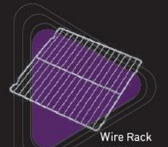
Wire Rack SH136