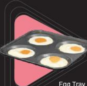
Egg Tray 2/3GN CIBO/ET