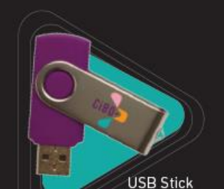
USB Stick CIBOPLUS/US