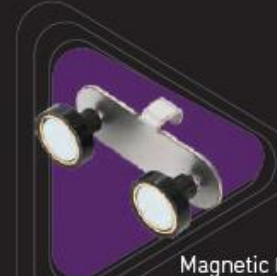
Magnetic Paddle Hanger LTH01