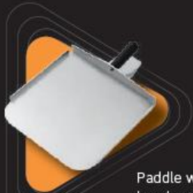
Paddle with handguard and sides LT02