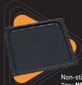
Non-stick Baking Tray NSBT23