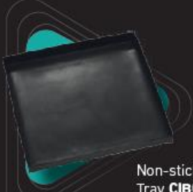
Non-stick Teflon Tray CIBO/TT