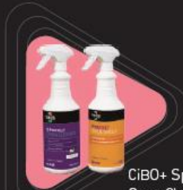
CiBO+ Sparkle Oven Cleaner OC01 CiBO+ Protect Oven Shield OS01