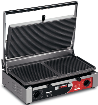
Sirman Panini Grills , model PDC L-R :

Sirman Spa Viale dell'Industria 9/11 35010 PIEVE DI CURTAROLO (PD), Italy Tel./Fax. +39 049 9698666 / +39 049 9698688 email: info@sirman.com