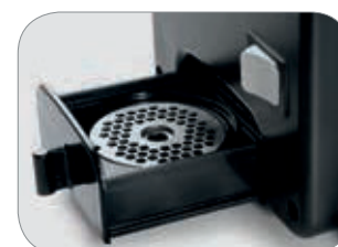
Cassetto porta coltello e piastra Compartment for knife and blade