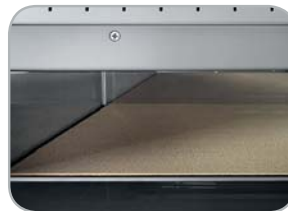
Piano di cottura in pietra refrattaria Refractory brick deck.